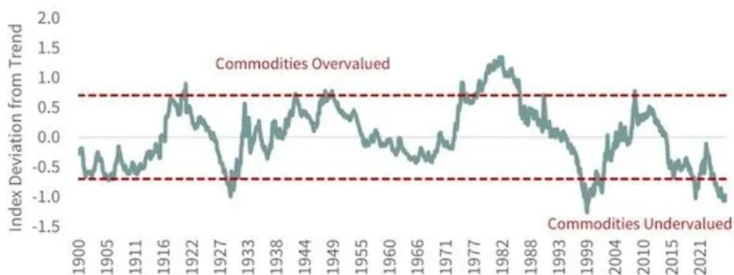
FIGURE 5 Spot Commodities / S&P 500 (Detrended)