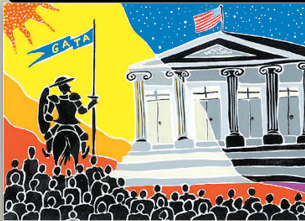
"GATA" by Alain Despert

The gold reserves of the United States have not been independently audited for half a century. Now there is proof that those gold reserves and those of other Western nations are being used for the surreptitious manipulation of the international currency, commodity, equity, and bond markets.